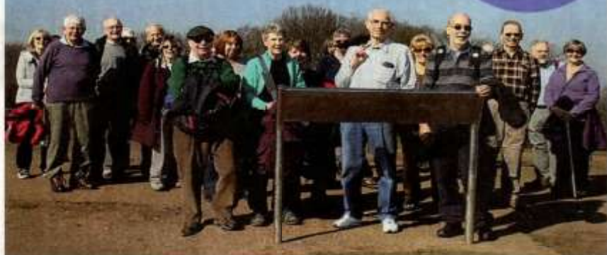
The group has taken part in walks all over the country